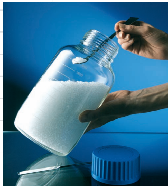
Easy media removal

Clicking sound – an aural and tactile 'clicking' gives positive confirmation that the bottle is firmly closed.