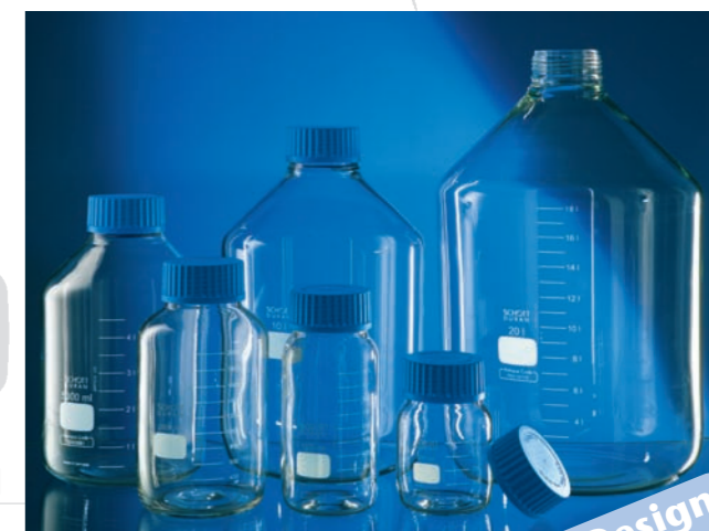
Choose from six different bottle sizes